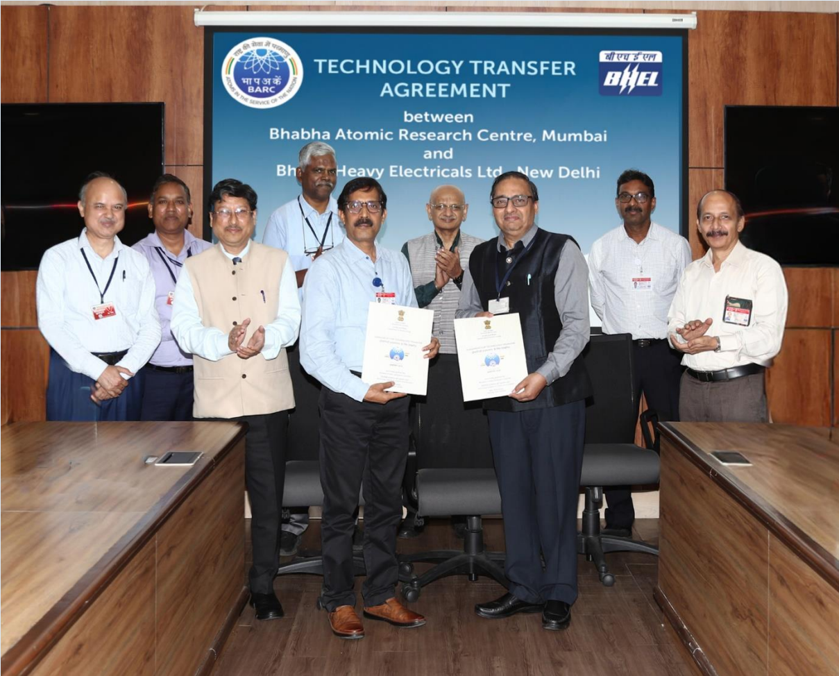
Technology Transfer Agreement with BARC